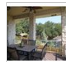
On the market in Lakeway, 01.22.12