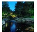
Hot properties, 01.22.12